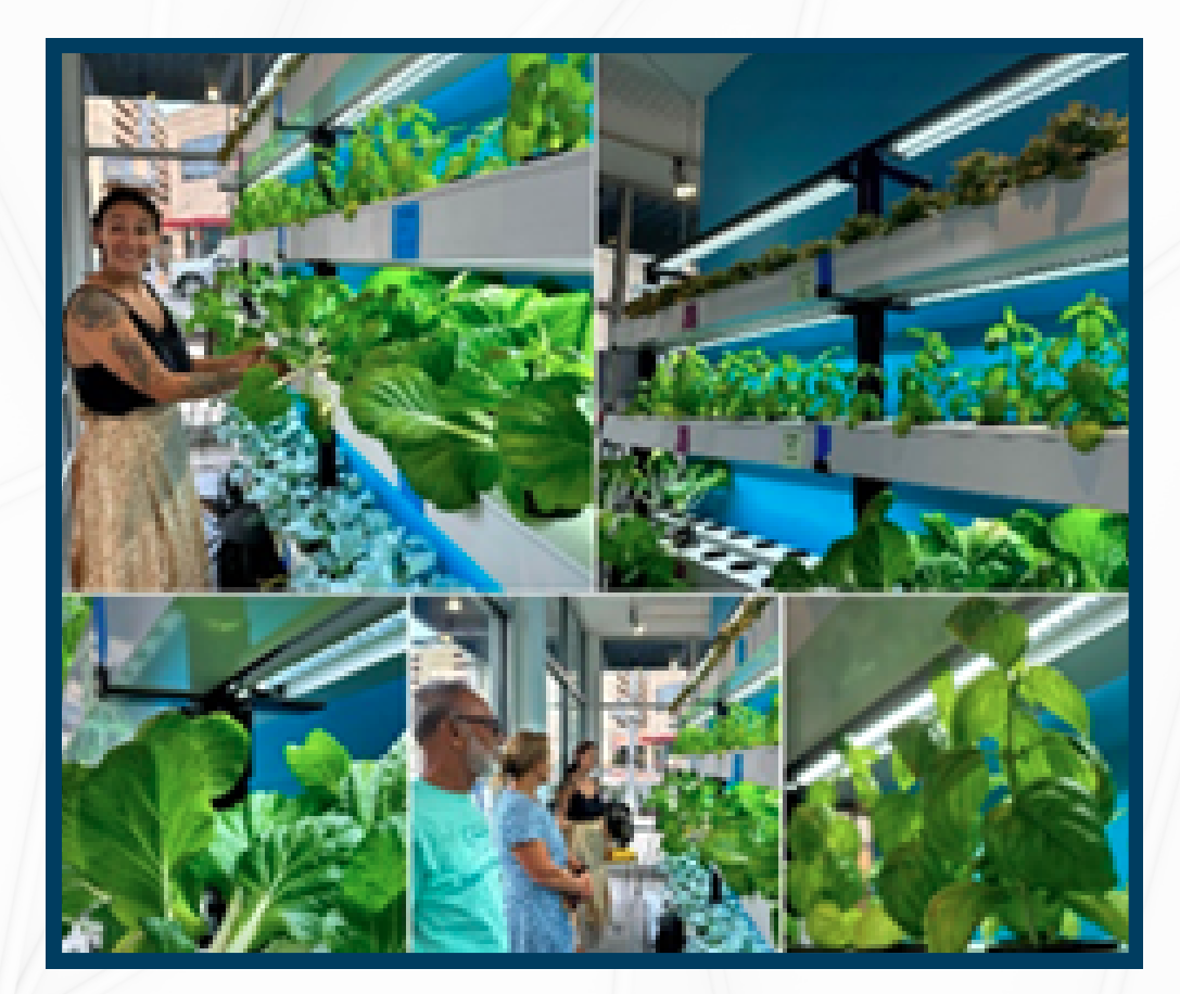
Micro-Grants to Ducktown's small businesses like CROPS for hydroponic farming